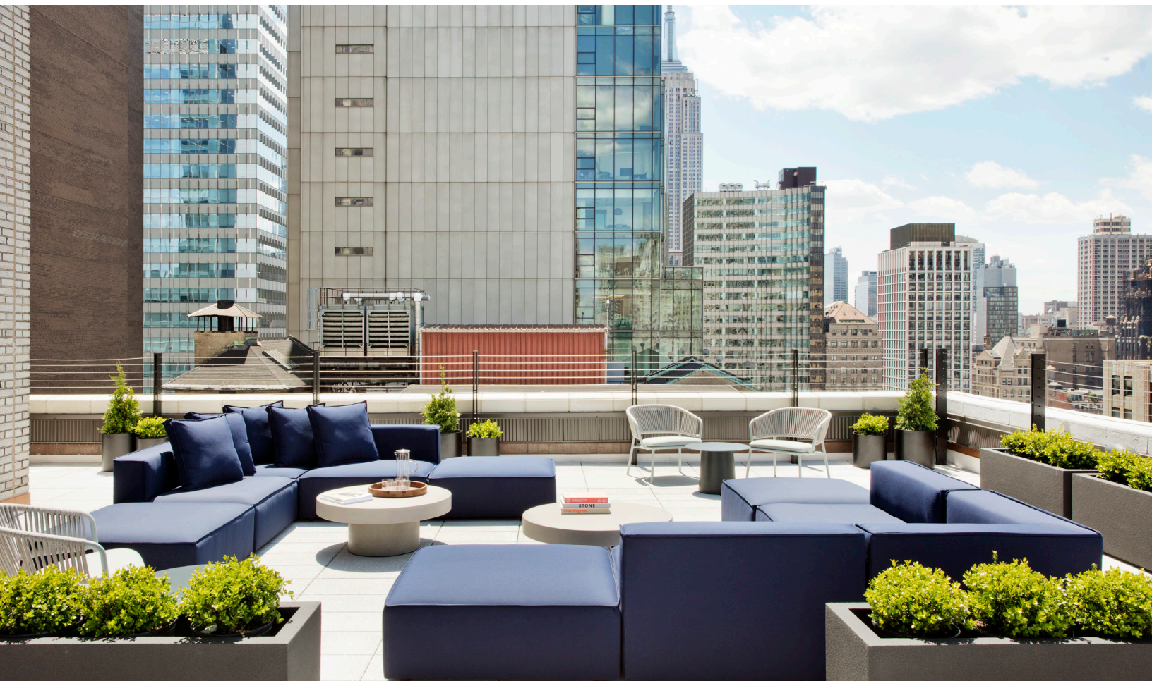
24th Floor Terrace