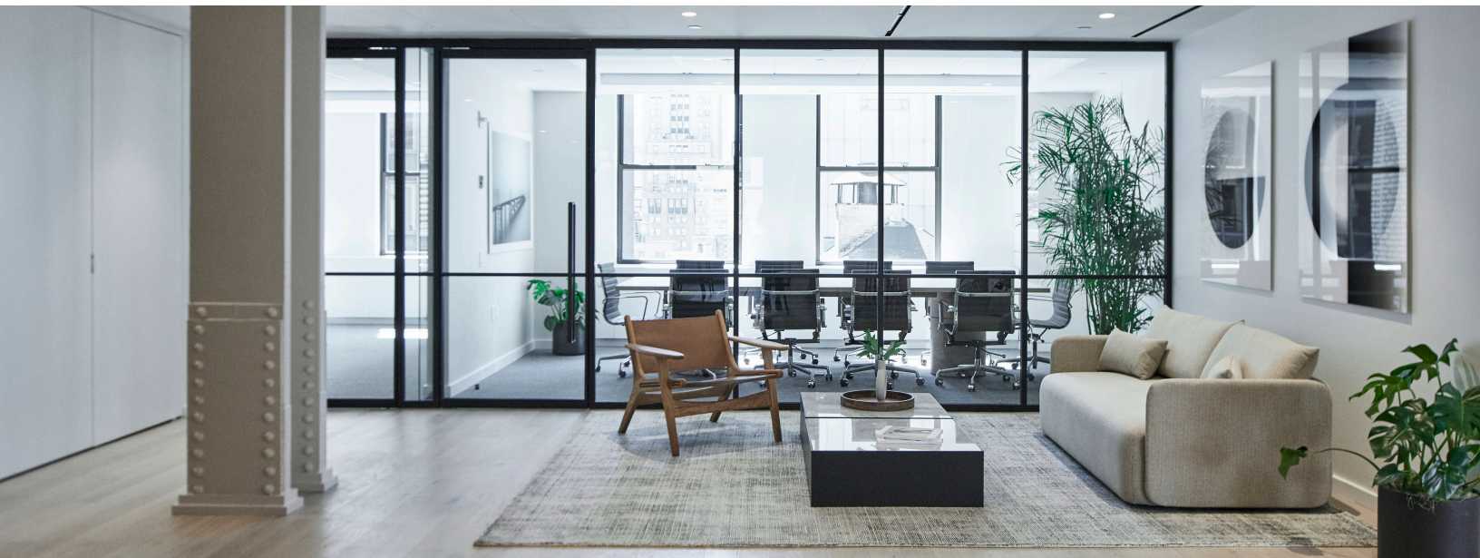
24th Floor Open Office